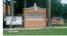
Example of company banners at one of our campuses.

Local businesses are the backbone of Pembroke Pines and our surrounding cities. The Support Our Schools (SOS) campaign offers local businesses and corporations alike an opportunity to positively affect the lives of the children in our community. The Pembroke Pines Charter School System has a total enrollment just under 6,000 students and over 3,200 families. Becoming a corporate partner not only enhances your company image by showing support of the children in the Pembroke Pines Charter Schools, it also offers your business a distinct marketing and competitive advantage by creating positive publicity and heightened visibility of your products and services to our charter school families and employees, as well as vehicle traffic.